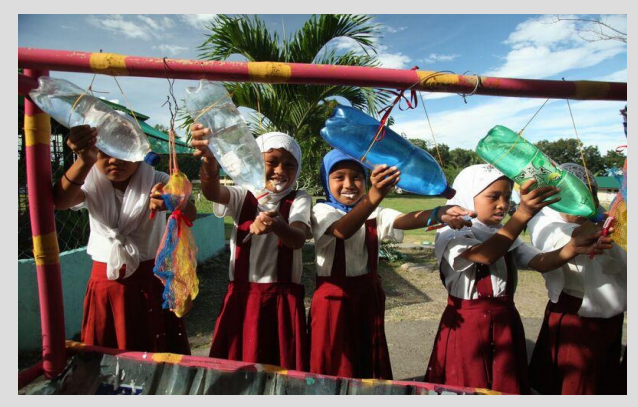
Illustration 3: Children using a tippy tap.

The tippy tap model that makes use of recycled water bottles and a simple drainage system is an example of such a low-cost alternative for hand washing and tooth brushing. More research and investment is needed in these community-based alternatives parallel with efforts to expand access to piped water and traditional sewage systems (#19129).