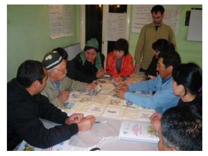
Figure 1: Sanitation approaches can be more empowering if both women and men are involved in planning and training: Sanitation workshop in Central Asia (source: F. Jorritsma, WECF, 2010).

One of the most significant divides between women and men, especially in developing countries, is found in the sanitation and hygiene sector. The provision of water, hygiene and sanitation is often considered a woman's task. Women are promoters, educators and leaders of home and communitybased sanitation practices yet their own concerns are rarely addressed. Societal barriers often restrict their involvement in decisions regarding sanitation facilities and programmes (GWA, 2006).