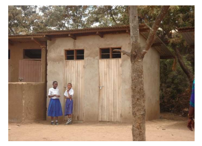
Figure 2: School toilet in Tanzania: The special needs of girls and women during the time of menstruation – such as privacy, facilities for disposal of sanitary materials – must be brought to the forefront.

Experiences with gender aspects in water and sanitation projects in Armenia, Bulgaria, Romania, Ukraine and Mexico showed that stronger involvement of civil society, women and minority groups in decision making on sanitation and wastewater systems is necessary to make a breakthrough and to enhance participation and capacity building (Milhailova and Diaz, 2007).